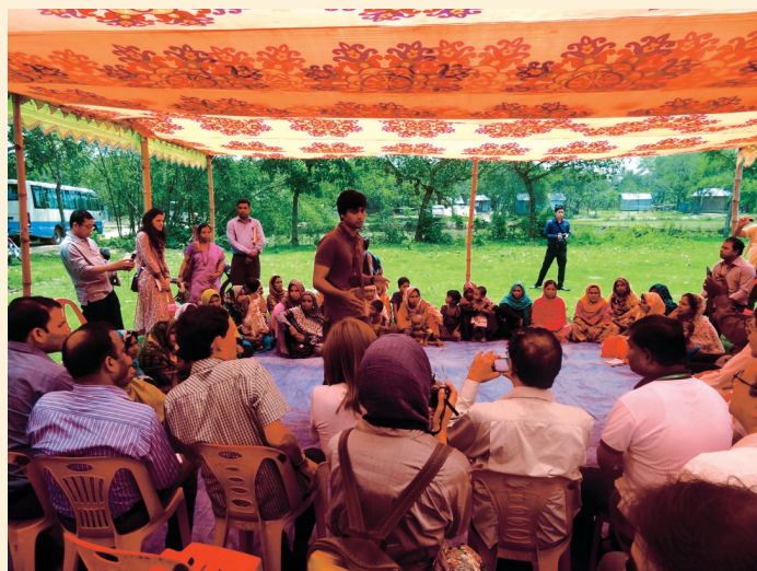
Field visit in one of the rural women's groups during the Regional Policy from in Dhaka, Bangladesh

The activity was conducted on 20-21 May 2014 at Radisson Ble Water Garden Hotel, Dhaka, Bangladesh in support to the 64 th EXCOM and 19 th General Assembly meetings of APRACA. There were six (6) invited international resource speakers from India, FAO-Italy, the Philippines, and Thailand. Also, it was supported by local field visit to Bangladesh Bank and BRAC coordinated project for rural women who are considered one of the most vulnerable rural and agricultural actors.