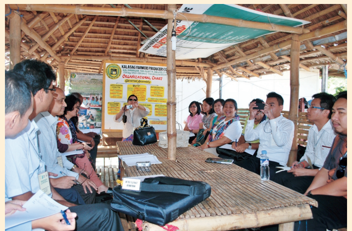
The ESV-AVCF Participants during the field visit in Kalasag Cooperative on 22 April 2014 in San Jose City Nueva Ecija, Philippines

Furthermore, it provided the participants understanding of the rural and agricultural development in Nueva Ecija where agricultural value chain finance strategies and practices are employed. Specifically, there were eight (8) approaches,