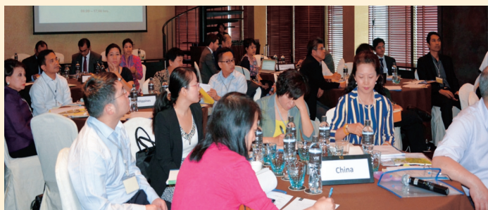
Section of the participants in the IFAD-APRACA RuFBep Project Inception Workshop held during 15-16 May 2014 at VIE Hotel, Bangkok, Thailand

The inception workshop held in the VIE Hotel in Bangkok, Thailand during 15-16 May 2014 to launch the project on “Documenting Global Best Practices on Sustainable Models of Pro-Poor Rural Financial Services in Developing Countries” (RuFBep Project) managed by the Asia-Pacific Rural and Agricultural Credit Association (APRACA) and funded by the International Fund for Agricultural Development (IFAD). The project will identify the rural finance best practices which are scalable and implantable through research, pilot testing and scaling up adoption. The project covers five target countries, People’s Republic of China, Indonesia, India, the Philippines and Thailand during the period 2014-2018.