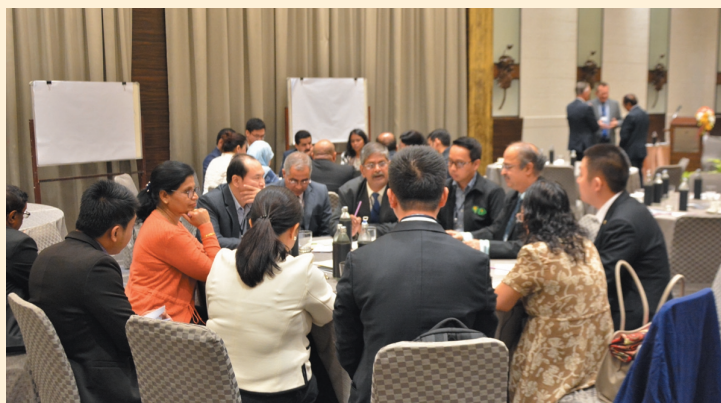
The participants of Global Dissemination Workshop are discussing on the way forward to pilot rural finance best practices

The global dissemination workshop was attended by participants from 16 countries from Asia-Pacific region and global participants from International Agencies UNCDF, World Bank apart from experts from IFAD. The workshop was participatory in nature and the participating country groups and experts were allowed to share the results from the pilot testing conducted in their provinces with the participants of the workshop, followed by in-depth discussions on the learning, scalability, effectiveness and impact of these interventions while also highlighting the specific risks and challenges faced during the course of undertaking these interventions. A key aspect of the workshop was the focus of the presentations and discussions by the