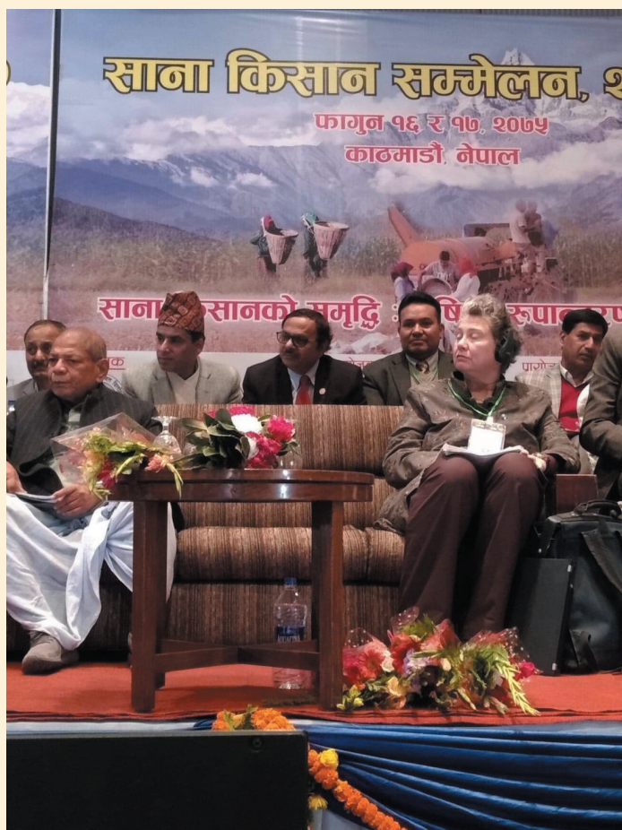
Secretary General, APRACA participating in the discussions on way forward to support the small farmers and their cooperatives

entrepreneurship development through a dialogue among practitioners, regulators, specialists based on concrete research findings as well as through best practices. About 1000 delegates and leaders from Small Farmer Agriculture Cooperative Ltd. (SFACLs) participated in the summit.