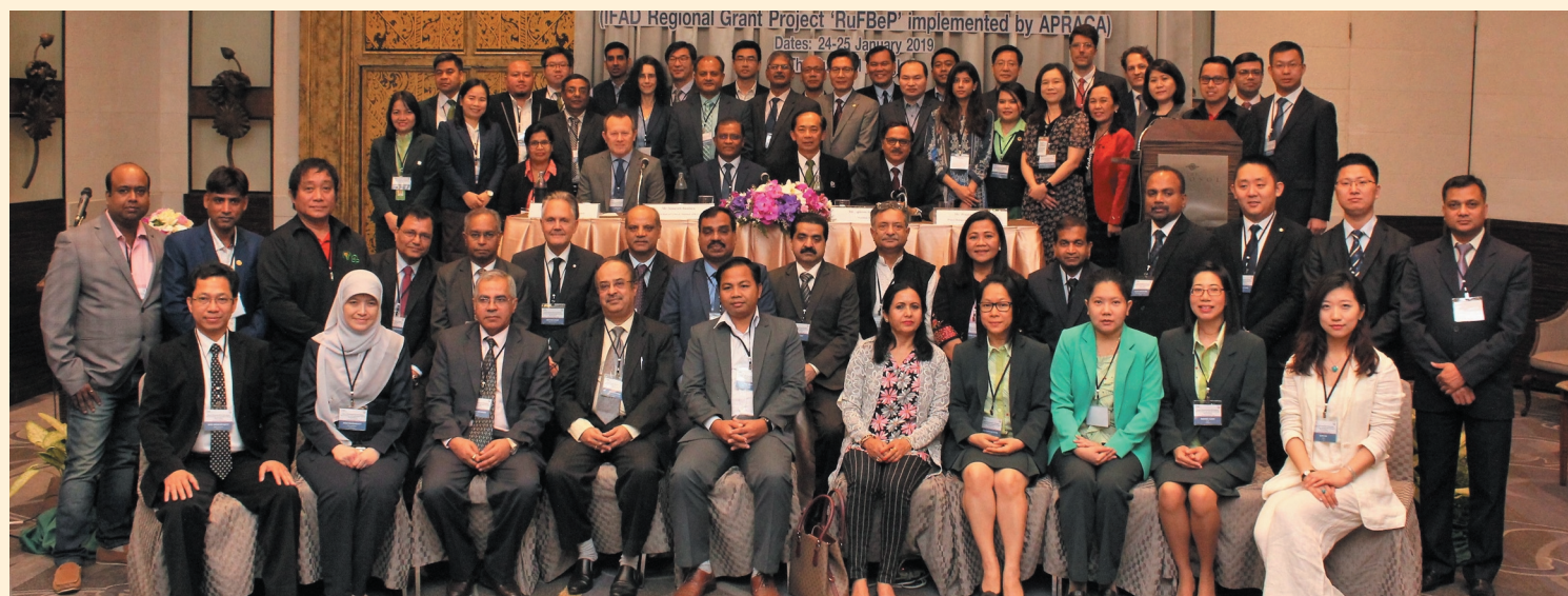
Delegates of Global Dissemination Workshop on Rural Finance Best Practices held in Bangkok on 24-25 January 2019

Acknowledged leader in rural and agricultural finance | Vol. 6 Issue 1