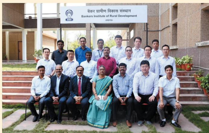
Group photo of the participants and trainers during international programme on ‘Embracing digitization for finance and governance’