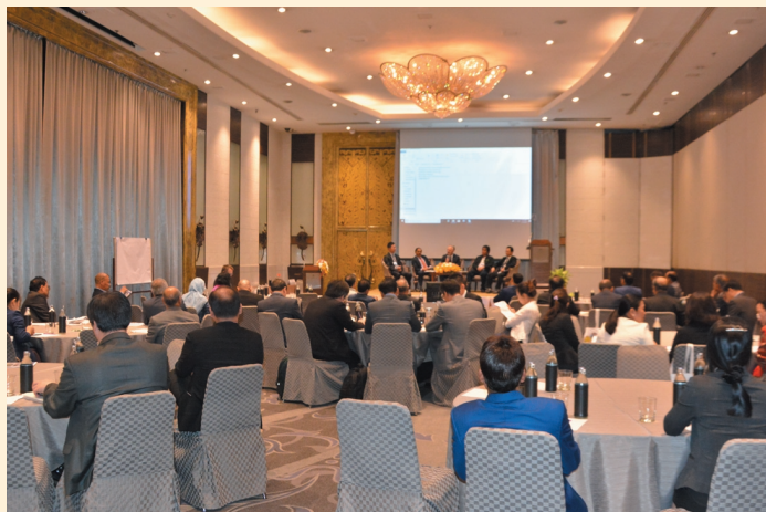
Section of delegates listening to the panelists and speakers during the Global Dissemination Workshop on Rural Finance Best Practices

sessions were on 'Impact assessment report of RuFBEP pilot testing: exploring area of improvement and scalability of the financial products and services. The participation of the delegates were with high commitments and meaningful discussions were taken place during the 2 days of the workshop.