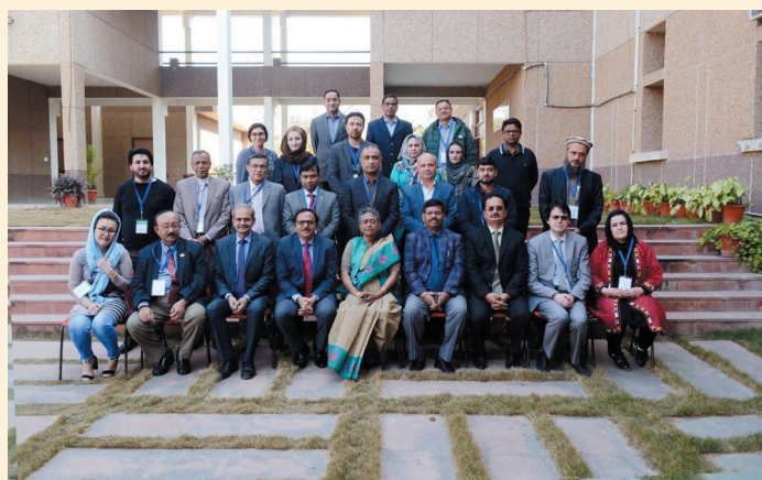
Group photo of the participants and trainers during international programme on 'Self Help Groups: A tool for financial inclusion and women empowerment'