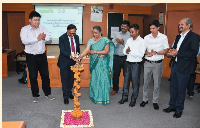
Inauguration of International training programme on ‘Embracing digitization for finance and governance’ held in BIRD, Lucknow, India during 25-28 March 2019