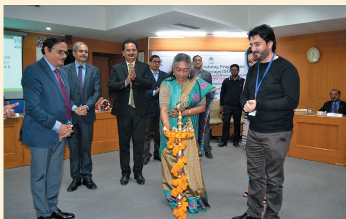
Inauguration of International training programme in BIRD Lucknow on 14 January 2019