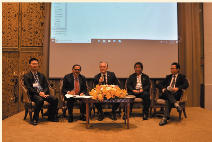
Panel Discussions on Digital Financial Services during the Global Workshop held in Bangkok on 24-25 January 2019

operating environment and their relationship with the global good practices; (g) Generate inputs from the global experts to deepen the contents and strengthen the impact assessment documents; (h) Match the findings with the thematic focuses and issues of the selected countries for the future scaling up and (i) Identify the financial institutions at the country level who will lead the scaling up of the identified good practice.