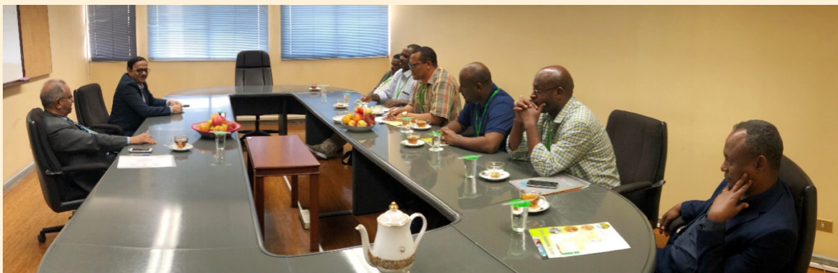
A High-level delegation from Microfinance Sectors of Ethiopia meeting the Secretary General at the APRACA Secretariat, Bangkok

commercial banks, experts from APRACA and World Bank, the participants also exposed with the practical experiences with Micro-Banker Project of FAO on Digital Banking Practical Applications for the MFIs and Cooperative Banks in Asia-Pacific region. The participants also visited the Bank for Agriculture and Agricultural Cooperatives (BAAC) to learn about their 'Digital Platform for Marketing Financial Services' in Thailand. The team also visited the Fintech Thailand Co. Ltd. who are supporting to make financial system more efficient by using advanced technology. The solutions provided by them include choosing suitable trading platform, implementing trading gateway to SET/TFEX, programming trading algorithms, coordinating with quant modelers and monitoring overall system performance. The programme was extremely successful for the participants.