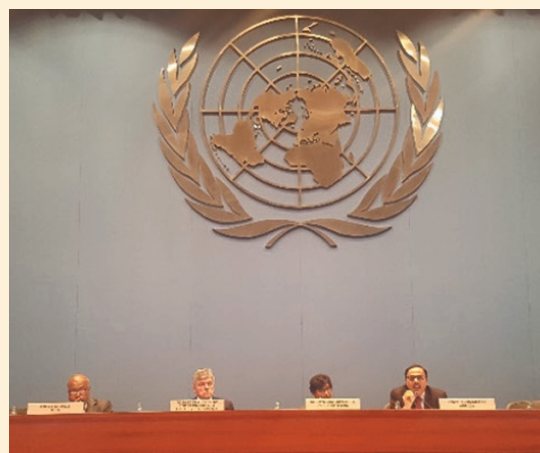
APRACA Secretary General speaking at the high-level plenary session on 'Nationally Determined Contribution (NDC) Implementation: Raising Ambition'.