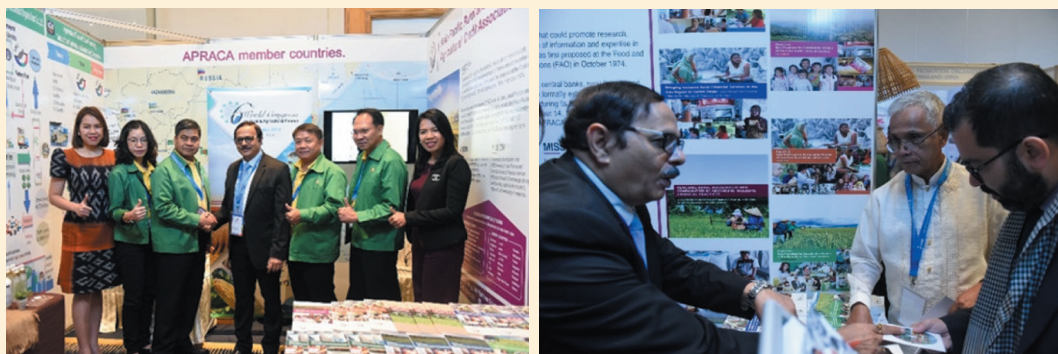
APRACA Secretary General and BAAC officials at the APRACA-BAAC Booth

APRACA and Bank for Agriculture and Agricultural Cooperatives (BAAC) jointly organized and set up a booth during the MKLF 2019 to showcase the products and services of BAAC and knowledge products of APRACA. During the 2 days of the event, the booth was visited by 65 participants and learned about the financial services provided by BAAC and the activities of APRACA in the Asia-Pacific Region.