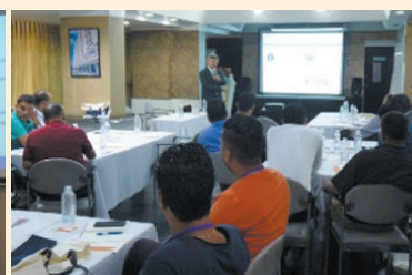
Participants of the international programme on Leadership Development listening and discussing with the faculties during the training sessions