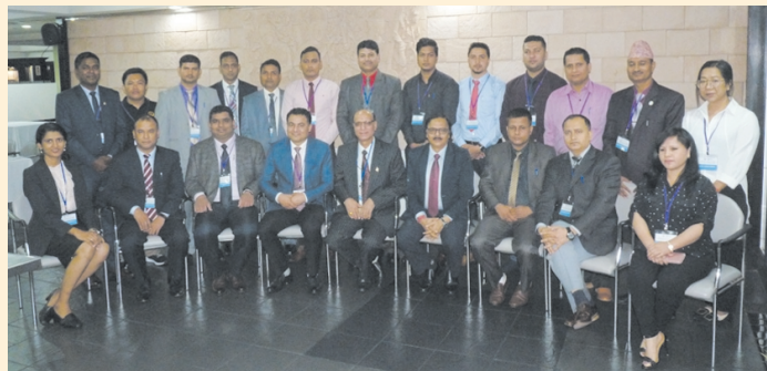
Participants from Nepalese financial institutions at the 'international programme on Leadership Development' in Bangkok

Banking, Finance and Insurance Institute of Nepal (BFIN) in collaboration with APRACA, Bangkok conducted a five-days international exposure visit and leadership development programme for the Financial institutions of Nepal during 23-27 September 2019 in Bangkok, Thailand. This programme was targeted exclusively for the officials in the banking and financial institutions of Nepal. In this programme, the trainees were exposed to the dynamics of leadership, team building, goal setting and strategic management issues being faced by the banking and financial institutions. The participants received training on the international standards of financial management and balance sheet analysis with special reference to Thailand by the experts from Bank for Agriculture and Agricultural Cooperatives (BAAC).