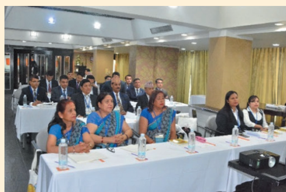
Participants from Employees Provident Fund, Nepal, BFIN and Faculties