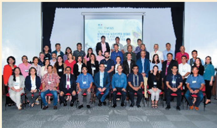
Delegates and speakers at the SEARCA-French Embassy organized conclave on 'Reducing Disaster risk Towards a Resilient Agriculture Sector'

institutions, actions, and (c) mechanisms to assume the full range of requirements, not just to reduce risks, but to ensure that the sector can rebound from the adverse impacts of shocks and stresses because of mechanisms available.