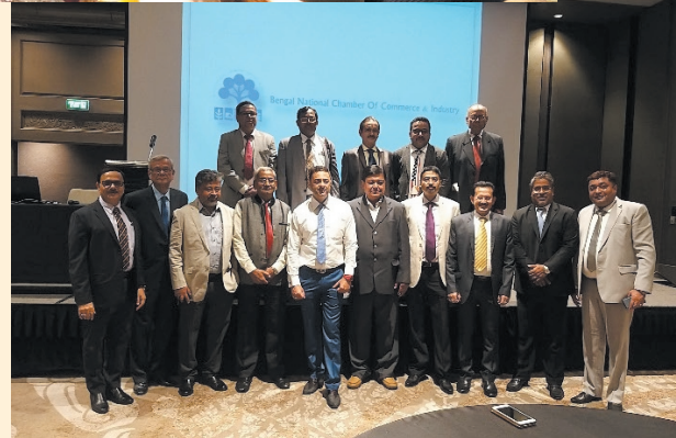
APRACA Secretary General speaking at the business summit of the BNCCI, India and Thai-Business Corporations