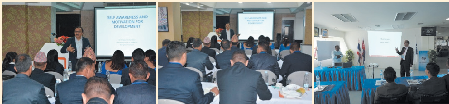
Participants from EPF, Nepal engaged in listening and discussions