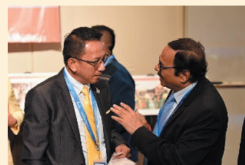
APRACA Secretary General discussing with the delegates during the MKLF 2019