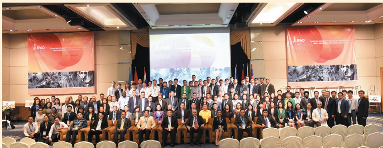
IFAD organized MKLF 2019 in Bangkok to showcase the best practices in agricultural development in Mekong Delta in Southeast Asia

APRACA was invited by the International Fund for Agricultural Development (IFAD) to join the 2 nd Mekong Hub Knowledge and Learning Fair (MKLF) 2019 held in Bangkok during 10-11 July 2019. The first MKLF was attended by more than 120 participants from IFAD loan and grant projects (including APRACA), government agencies, private sector and financing institutions which was held in Danang, Vietnam on 04-06 July 2018. The MKLF 2018 identified approaches and technologies for scaling up or replication and policy issues for attention. It also created spaces for cooperation and partnership among participants. Thirty-seven good practices and innovations