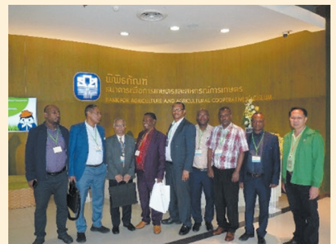
The delegation from Microfinance Sector of Ethiopia visited the BAAC HQ in Bangkok and discussed future collaboration on knowledge exchanges on digital finance

The Southeast Asian Regional Center for Graduate Study and Research in Agriculture (SEARCA) and French Embassy in the Philippines, in its interest to support the