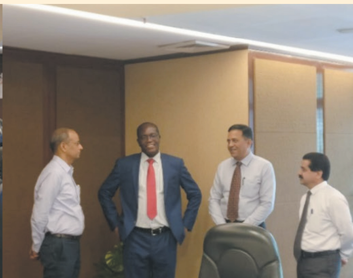
Delegates of 3 rd steering committee discussing on organizing 6 th World Congress